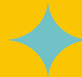
Illustration with Animation