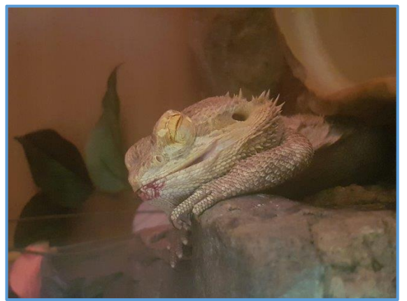
One of our bearded dragons is enjoying his foster home

The Animal Management team has also started using Microsoft Teams to run online lessons and this has been going well. Our animals are also doing well at their foster homes and our bearded dragons have been enjoying some raspberries.